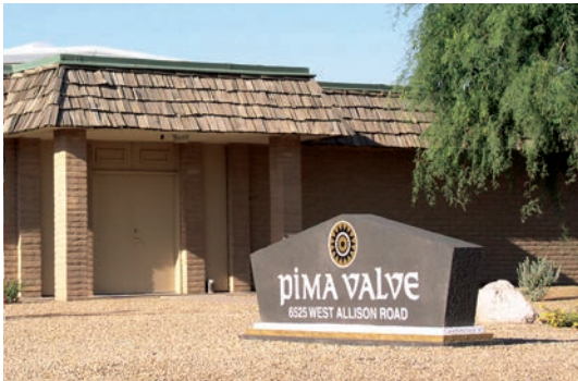
Lone Butte's first tenant Pima Valve