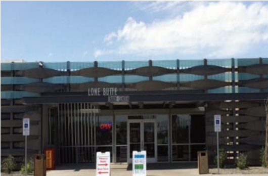
Lone Butte Trade Center - Opened July 1, 2014