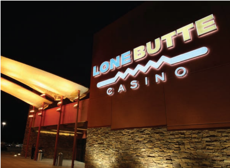
Lone Butte Casino

Every effort will be made by the Lone Butte Development Corporation to meet the requirements and demands of the clients that locate in the park. Lone Butte has been successful in attracting numerous companies to locate within the park by accommodating tenants on a long-term or short-term basis.