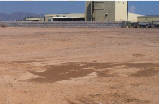
6880 W. Sundust Road