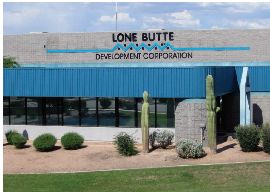
Lone Butte Administration Office Building

1235 S. Akimel Lane, Box 5000 Chandler, Arizona 85226 (480) 899-5280 (520) 796-1033 (520) 796-1032 fax