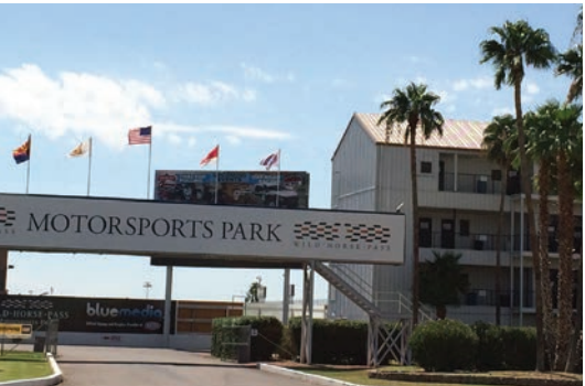
Wild Horse Pass Motor Sports