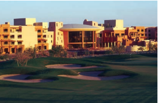
Sheraton Wild Horse Pass Resort

Lone Butte is just east of Interstate 10 and south of Route 202, providing major highway access to all of the region's well-maintained highway system.