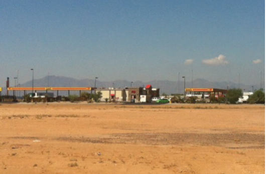
6991 W. Sundust Road