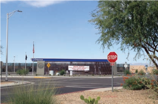
Kyrene Road expansion/improvements