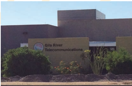
Gila River Telecommunications