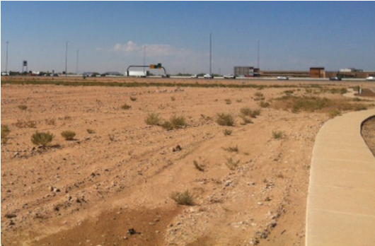
1400 S. Maricopa Road.