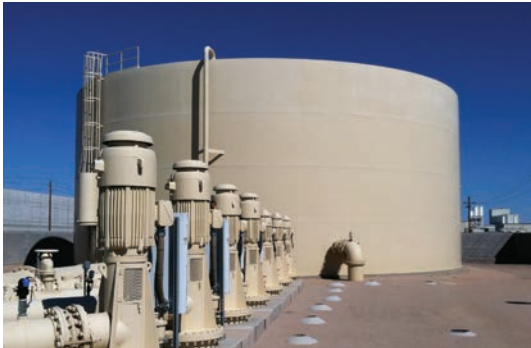
Lone Butte Tank 3 booster station.